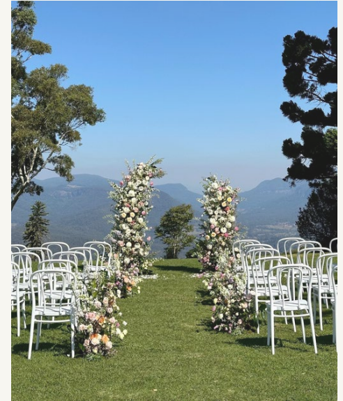
FLORAL PILLARS FROM $2500