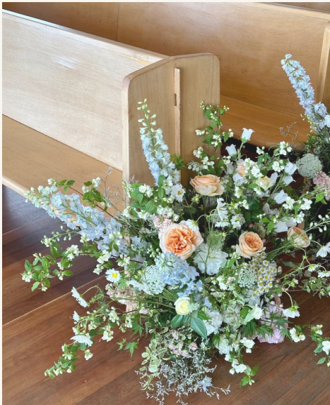
AISLE FLORALS FROM $250