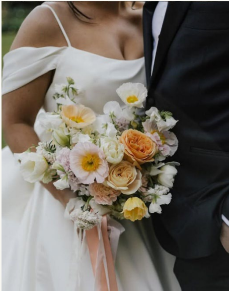
Bridal Bouquet: $350-$600

To give you an idea of our prices, here is an overview of some common wedding items our clients order. Pricing will vary depending on your final designs.