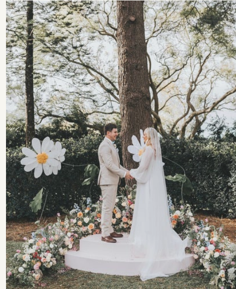
SEMI-CIRCLE FROM $2000