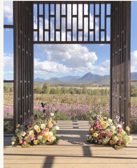
CEREMONY MEADOWS $750 EACH