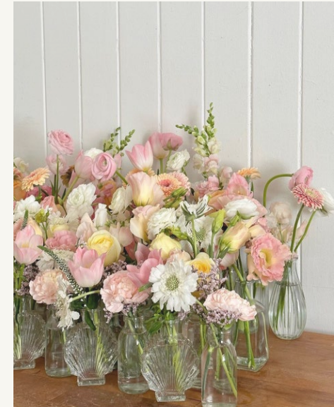
BUD VASES $20 EACH