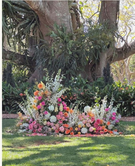
LONG MEADOW FROM $1800