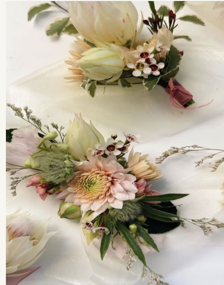
BOUTONNIÈRE $45 EACH