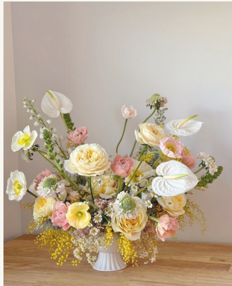
COMPOTE $250-450 EACH