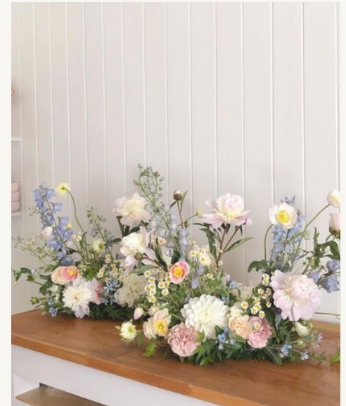
TABLE MEADOWS $160 EACH