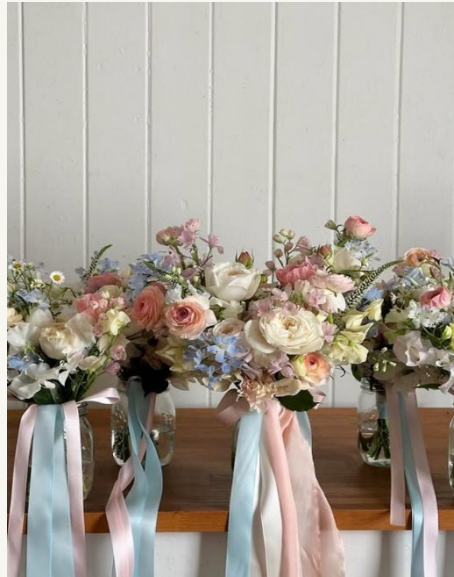
BRIDESMAID BOUQUETS: $150-$300