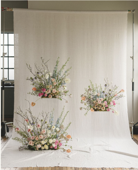
PLINTH FLORALS FROM $350